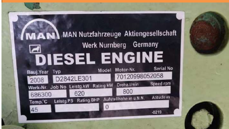
Engine Name Plate