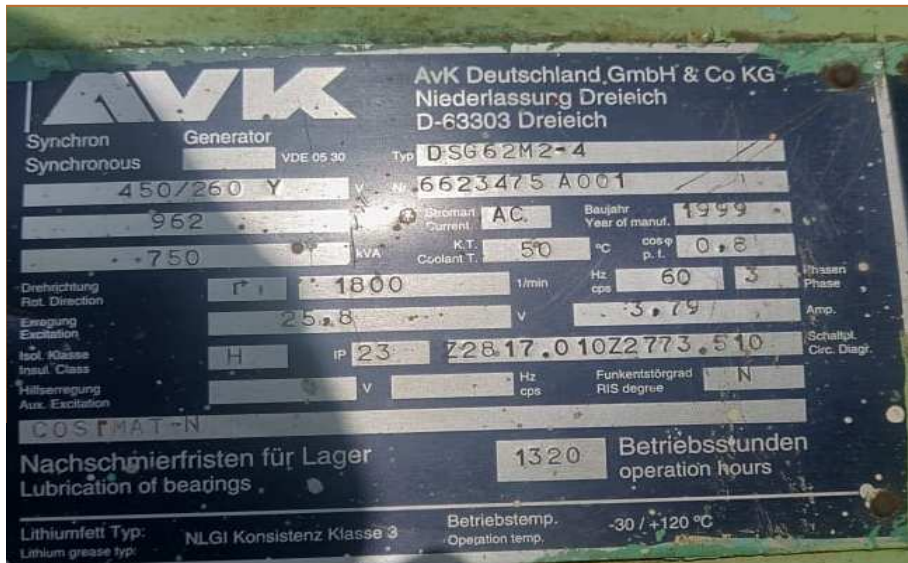
Generator Name Plate