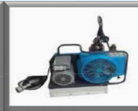
Breathing Air Compressor Bauer