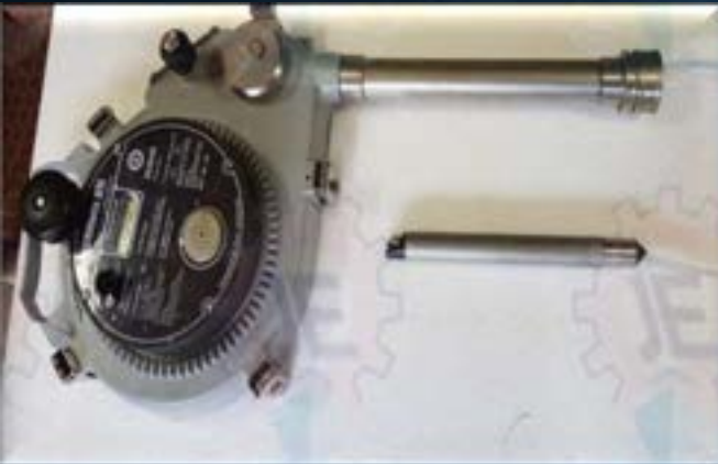
HERMETIC UTI TAPE MK3 LBI UNI-GT3