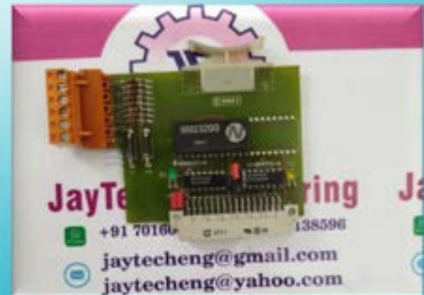
SAAB MARINE IO232 BURN IN 9240 05-503B PCB