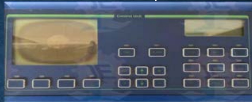
SIMRAD SDP/SJS DYNAMIC SYSTEM AND CONTROL UNIT