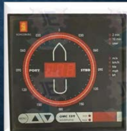
KONGSBERG OMC 139 WIND DISPLAY