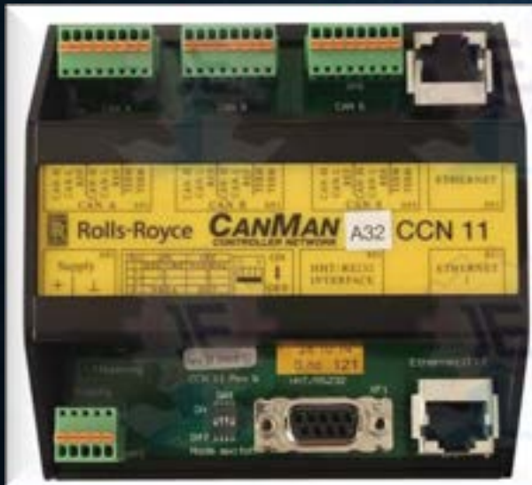
ROLLS ROYCE CCN-11 CANMAN CONTROL NETWORK