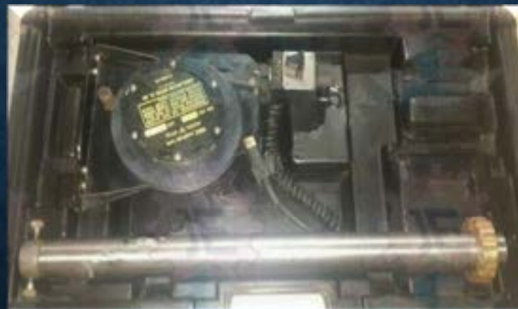
MMC CARGO SAMPLER OPEN TYPE MODEL D STYLE