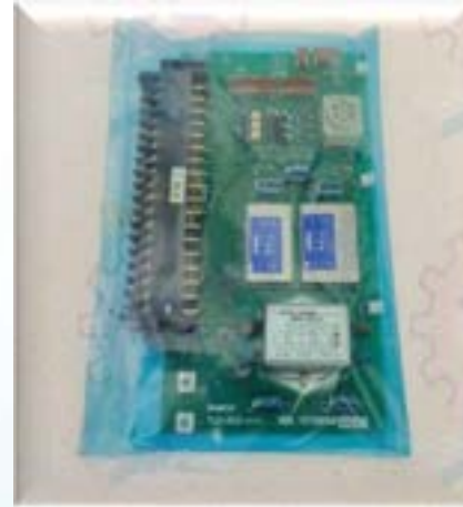
NABCO TLG-312-01A PCB