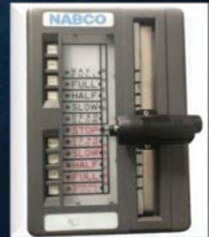
NABCO MG800 ENGINE TELEGRAPH UNIT