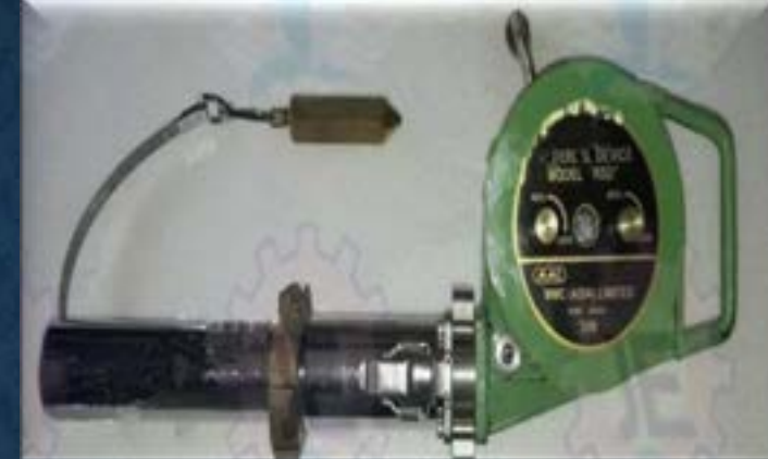
MMC SAMPLER TAPE REEL DEVICE RSD MMC ASIA LTD 30MTR