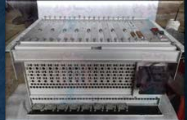
AUTRONICA GLN-90/8 LEVEL GAUGING SYSTEM CONTROL UNIT