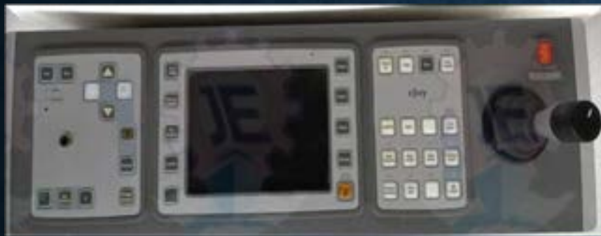
KONGSBERG C JOYSTICK OPERATOR TERMINAL