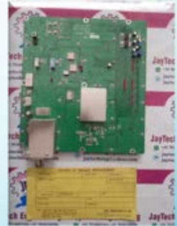
JRC CHE-202 A FTU PCB