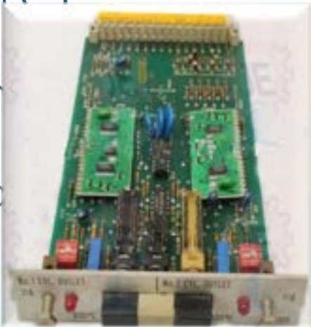
KONGSBERG KMC-220 PCB