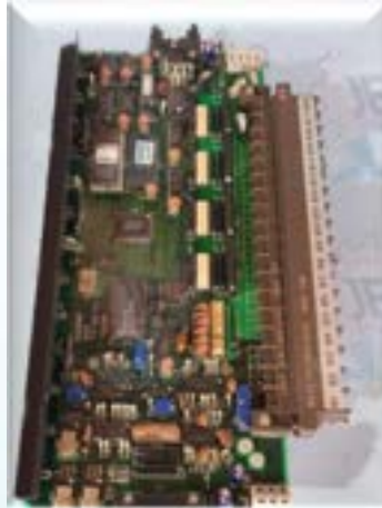
NABCO TLG -210-02 PCB