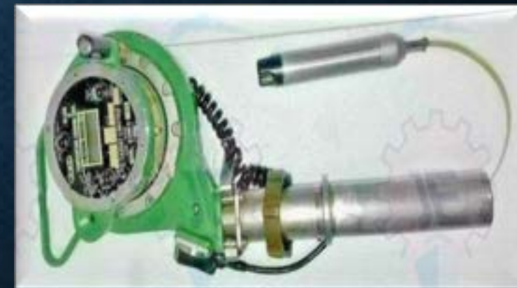
MMC ASIA CLOSED UTI TAPE MODEL: N 2401-2 TEMPERATURE ULLAGE INTERFACE DETECTOR