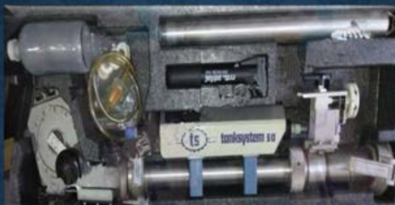
HONEYWELL TANKSYSTEM SAMPLER GTN