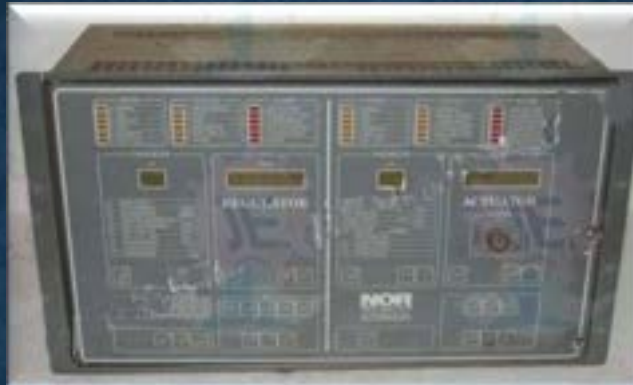
NOR CONTROL DGU 8800 DIGITAL GOVERNOR UNIT