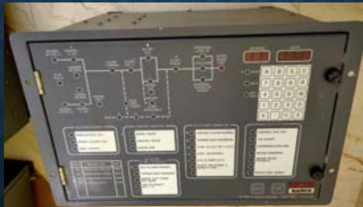
NABCO M 800 II MAIN ENGINE CONTROL SYSTEM