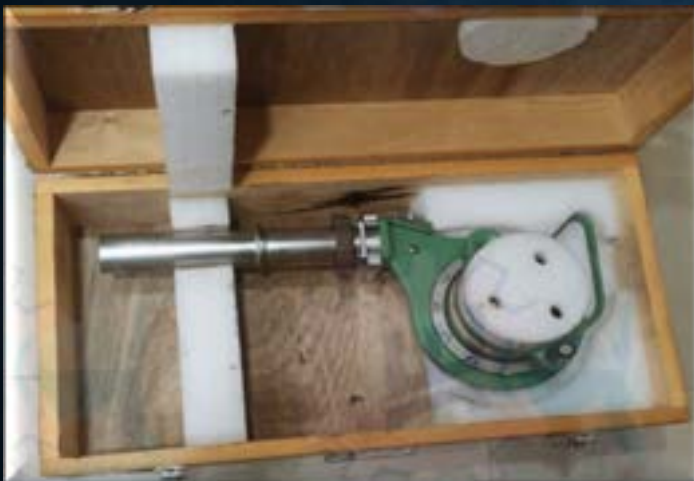
MMC UTI TAPE MODEL NO. N-2401-2. UT