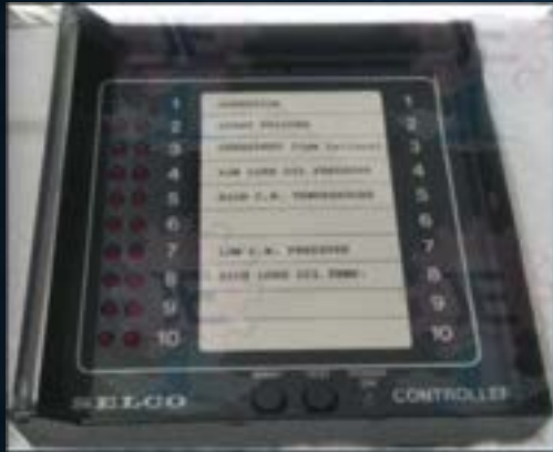
SELCO CONTROLLER M2000