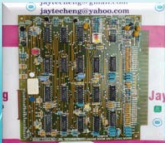
ASSY 727252 PE ENGINE ROOM UNIT-LOGIC BOARD