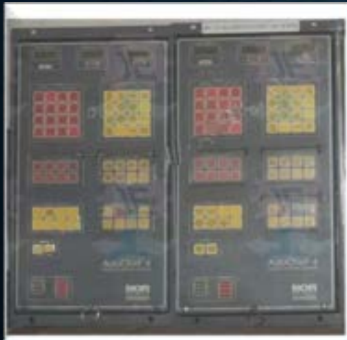
NOR CONTROL AUTOCHIEF REMOTE CONTROL SYSTEM