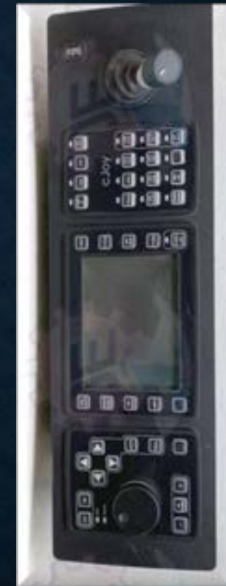
KONGSBERG C JOY JOYSTICK OPERATOR TERMINAL MK2