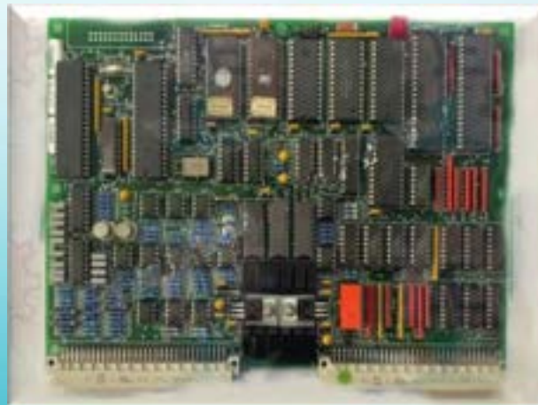
ROLLS ROYCE MARINE DC0016B V2 PCB